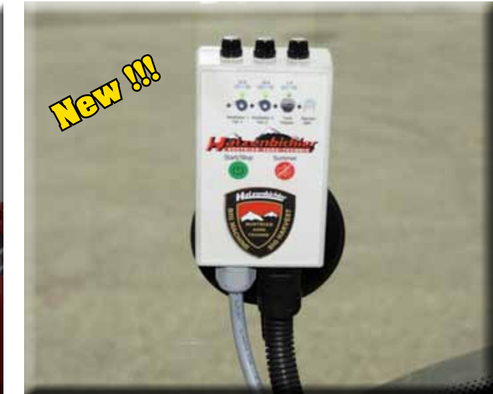
Electrical monitoring for „Air 8“ mechanical - Fan 1 and 2, level and drive monitoring