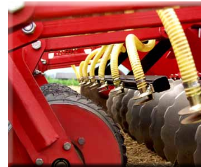
Distribution baffle for accurate seed distribution