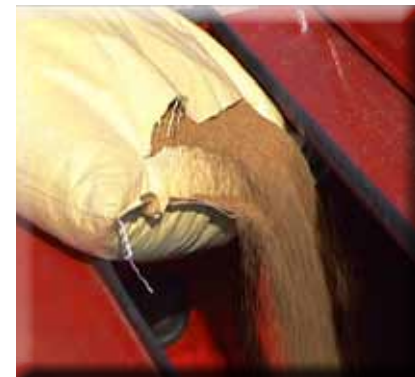
← AIR 8 during filling (large Tank opening, large viewing window)