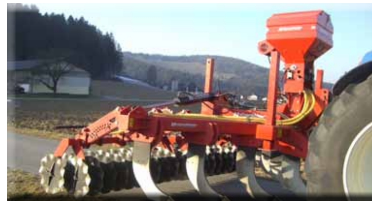
5-tine „Delta“ with „Air 8“