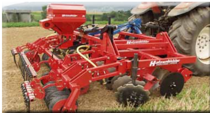
4m „Disko“ with „Air 8“