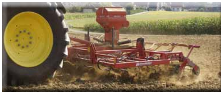
5,50m cultivator with „Air 8“