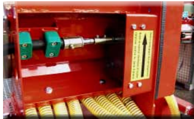
It is driven by a drive wheel, which is about the power of a flexible shaft (Ø 12 mm) transfers for continuous oil bath gearbox.

When the adjustment variable transmission is carried out by hand, the electric drive system from the tractor seat. An agitator to prevent bridging (trouble-free operation). For small seed is the opportunity to share a few simple steps, the rough seed roller against a fine seed roller.