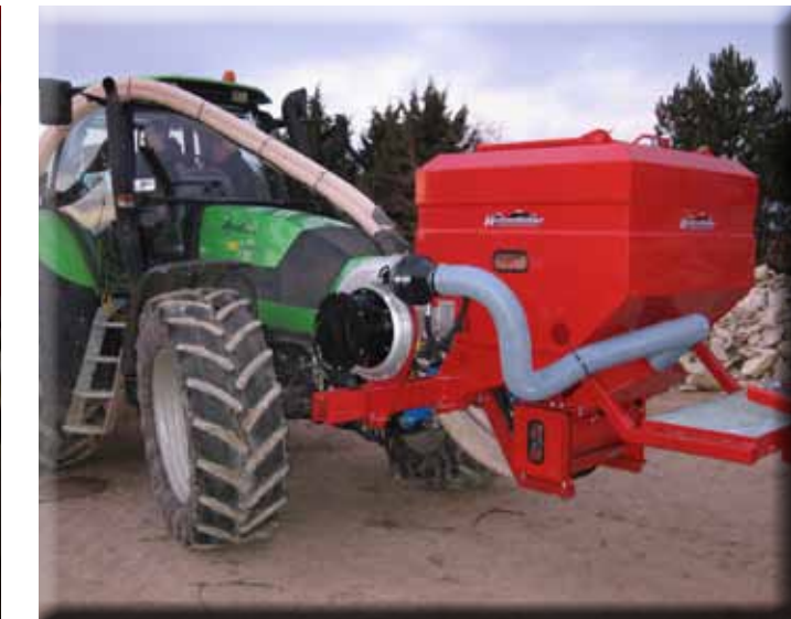
Hatzenbichler „Air 16“ with 400 liter hopper, equipped with hydraulic fan drive and electronic control