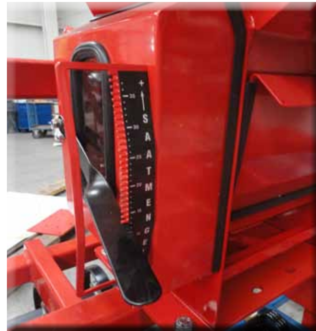
The adjustment of the sowing rate is quick and easy by hand