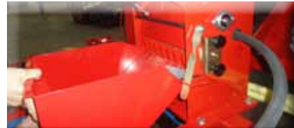
Calibration bucket for „Air 8“