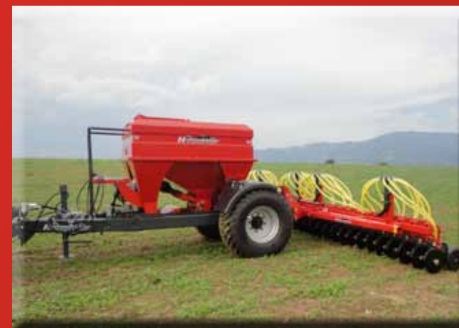
Pneumatic seeder „Air 16“, Semi mounted with hydraulic 3-point in the rear, hydraulic fan, onboard computer, Seeding machine with a capacity of 3000 litres Hornet - Series Drill