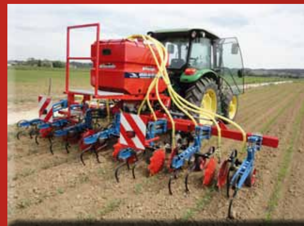
Pneumatic fertilizer for 6-row corn cultivator for introducing fertilizers with simultaneous weed control