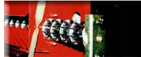
Rough seed roller with bearing block