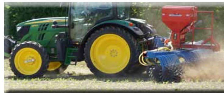
6,40m Rotary Hoe with „Air 16“