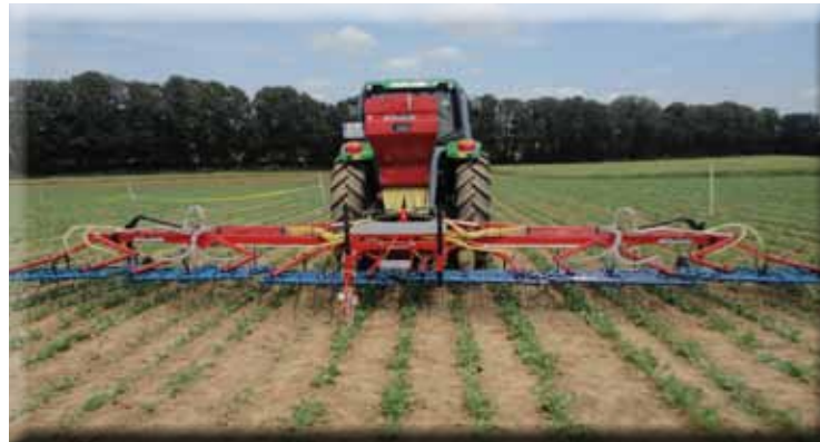
9m Harrow with „Air 16“