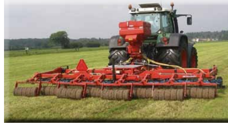
6m Vertikator with „Air 16“ for grassland care