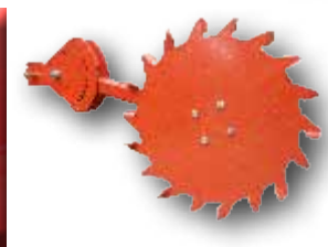
The drive wheel with sensor ensures that pulses with the electric motor (distance sensor)